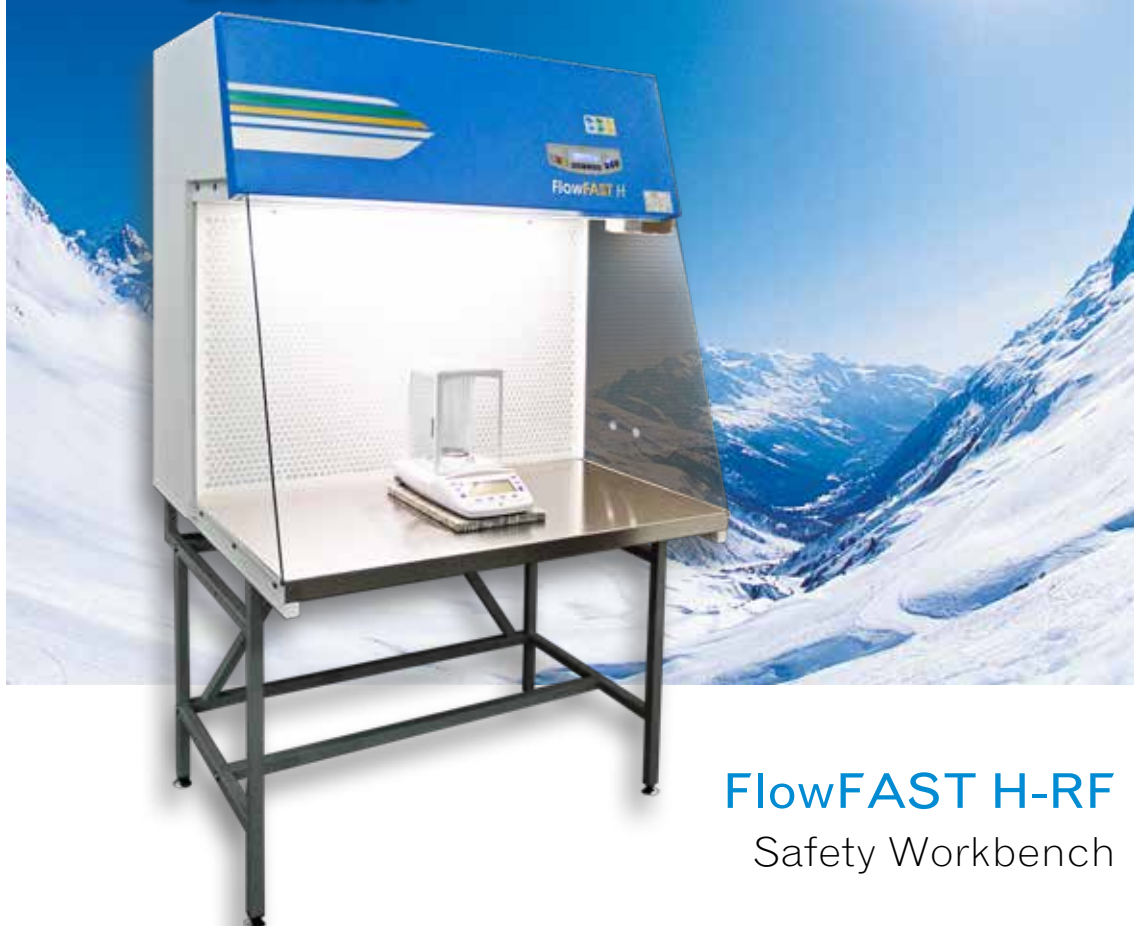
FlowFAST H-RF Safety Workbench