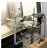
KI DISCUSS TEST