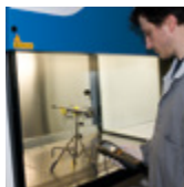
AIR FLOW SPEED TEST

Each Faster cabinet is tested conforming to EN-12469:2000, DIN-12980:2005 EN-61010:2001 and released with FAT certificate of the tests performed.