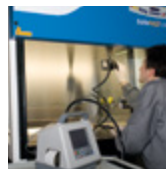
FILTER LEAKAGE TEST